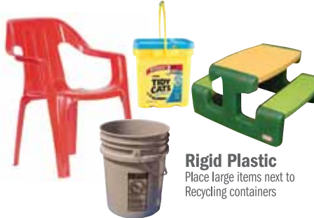
Rigid Plastic Place large items next to Recycling containers