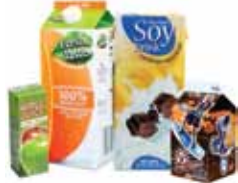
Food & Beverage Containers Empty containers only