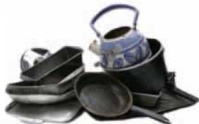
Kitchen Cookware Metal pots, pans, tins & utensils