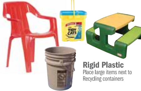
Rigid Plastic Place large items next to Recycling containers