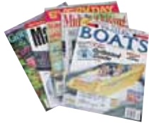
Magazines & Catalogs All types & sizes