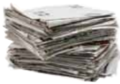
Newspaper Remove bags, strings & rubber bands