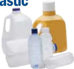
Plastic Jugs/Bottles/Household Plastic Empty containers only