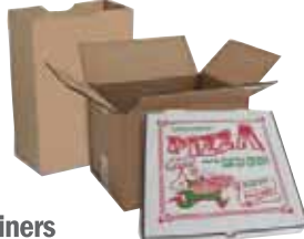
Cardboard, Pizza Boxes & Paper Bags Flatten cardboard & cut into pieces. Remove wax paper from pizza boxes