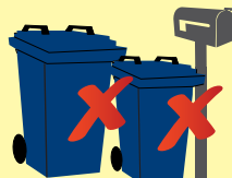
Objects & Carts Too Close Together