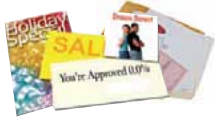
Office Paper & Junk Mail Envelopes, Flyers, Brochures, Postcards, etc.